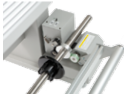
> 30 kg motorised take-up system